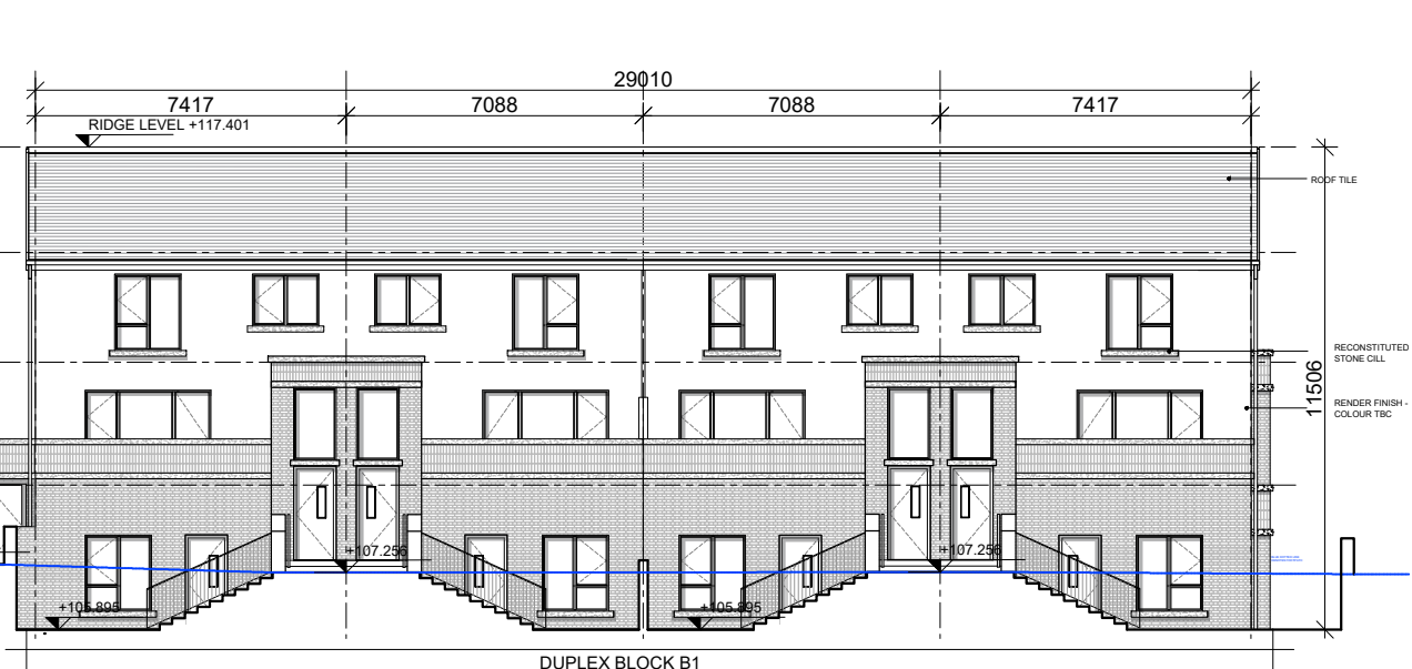
3 South Facing Elevation 0454